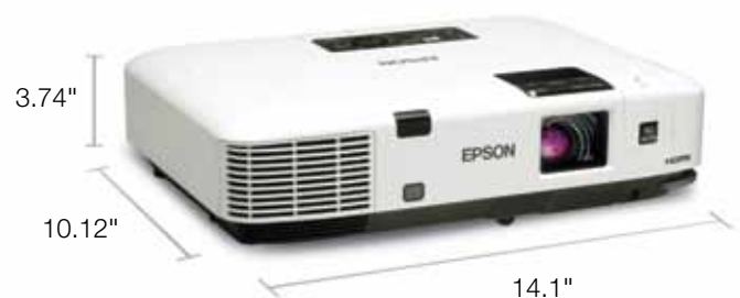
▲ Compact and portable design

Actual photographs of images taken from two competing projectors run in default mode. Price, resolution and brightness (white light output) are the same for both projectors.