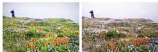
High color light output