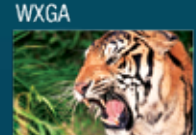
1280 x 800 Offers the highest quality and is ideal for widescreen (16:10) display