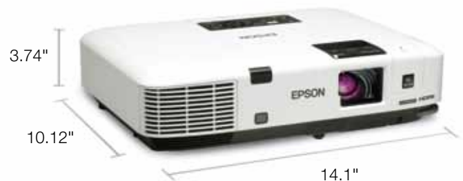
▲ Compact and portable design

Actual photographs of images taken from two competing projectors run in default mode. Price, resolution and brightness (white light output) are the same for both projectors.