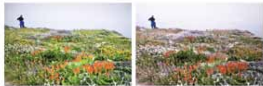
High color light output